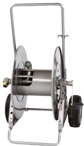
Portable Hose Reel Model: AT1200