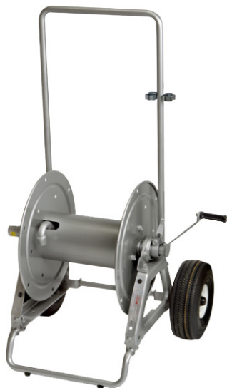
Portable Hose Reel Model: 1100