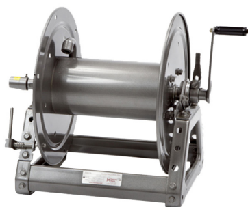
Manual Rewind Reel Model: 1520-17-18